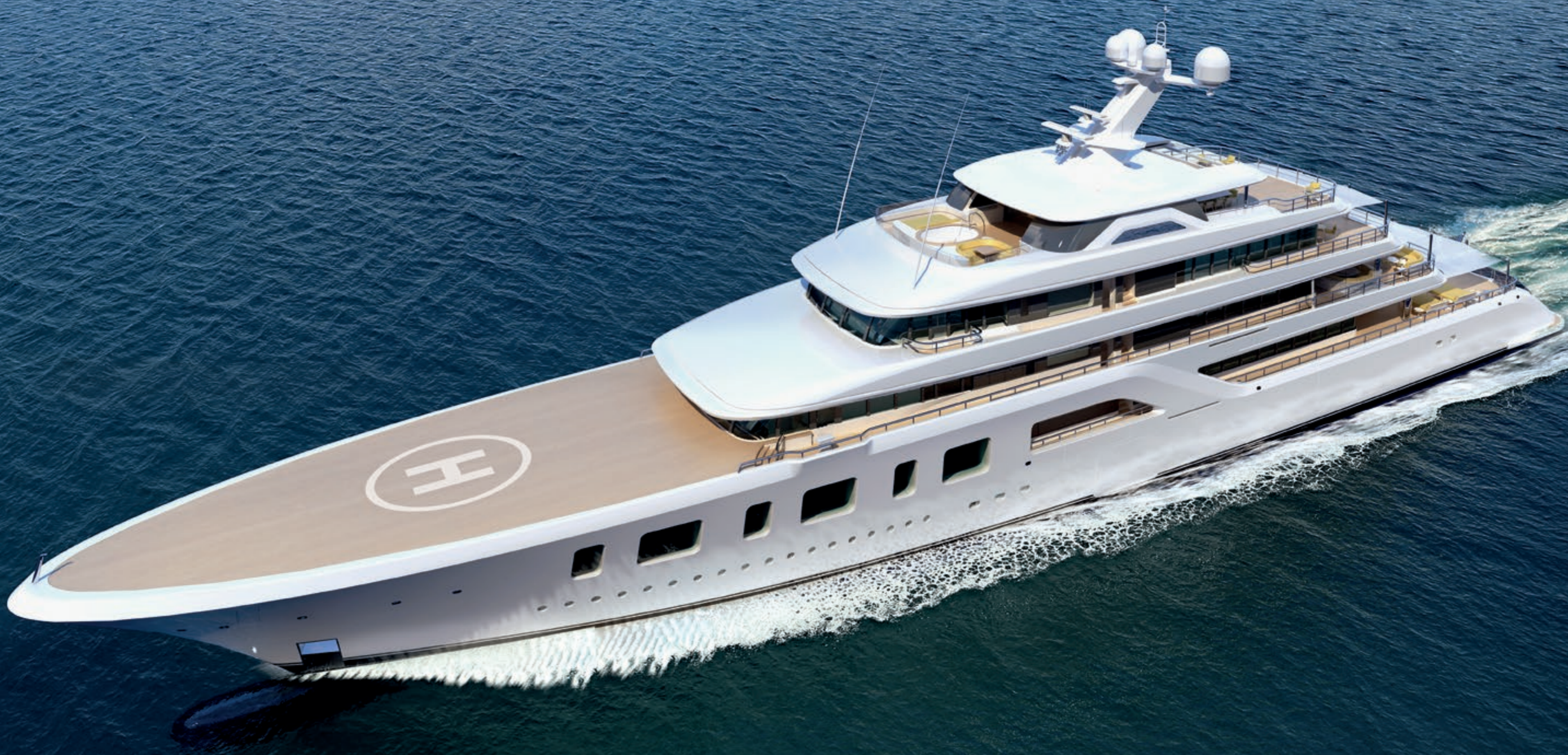
The large foredeck provides a landing pad for an EC135 helicopter.