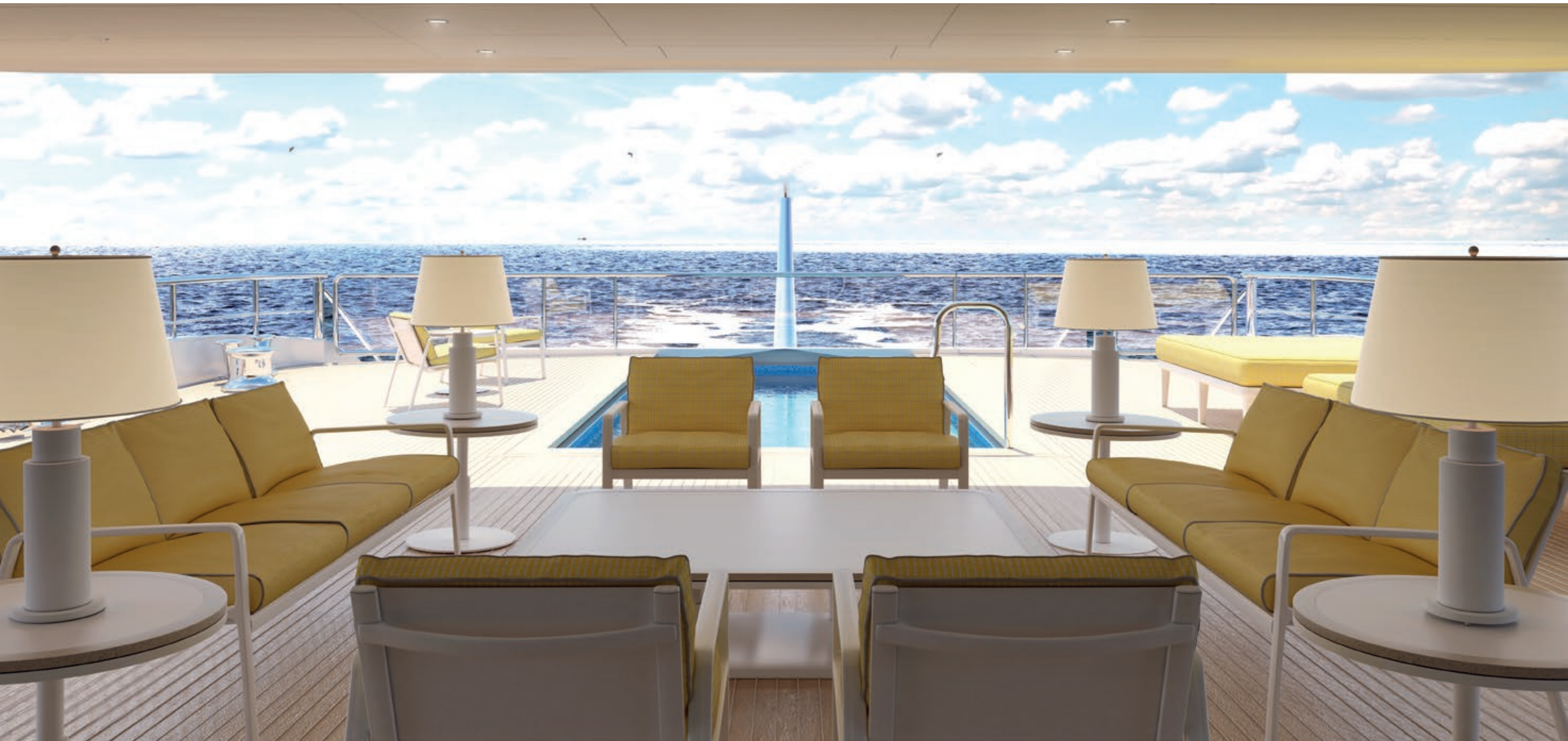
Outdoor relaxation areas around the pool.