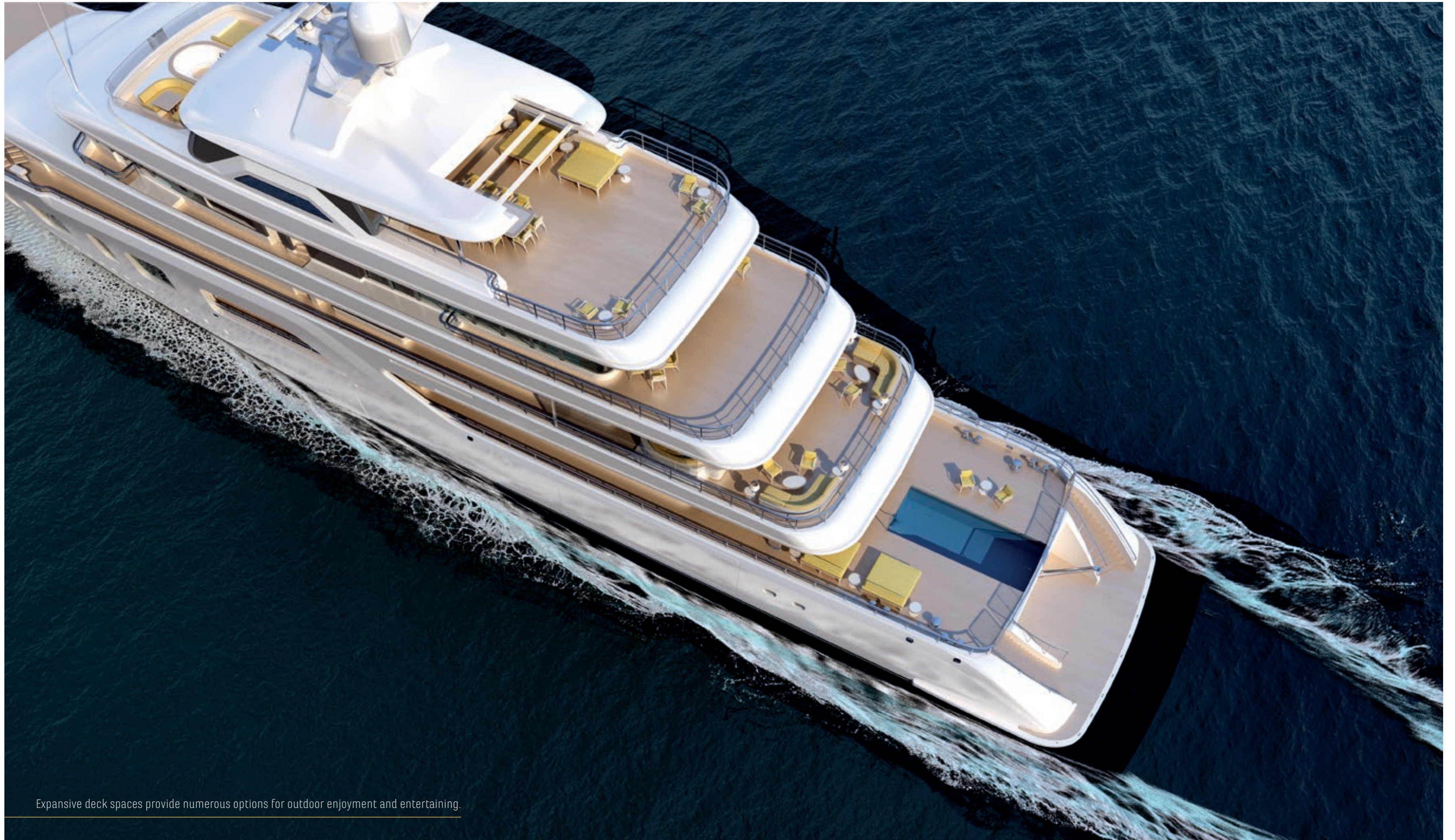
Expansive deck spaces provide numerous options for outdoor enjoyment and entertaining.