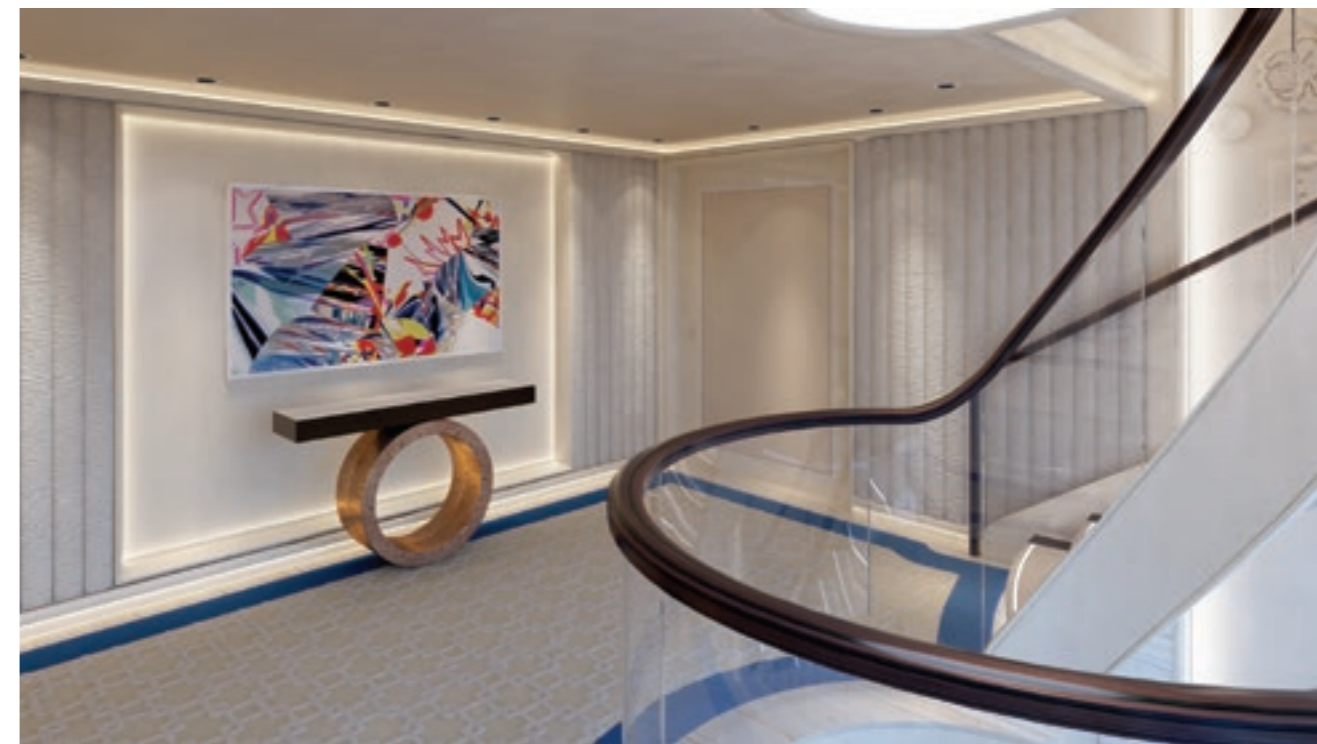
The large central atrium is dominated by a grand spiral staircase with a multi-level glass wall providing unobstructed external views.