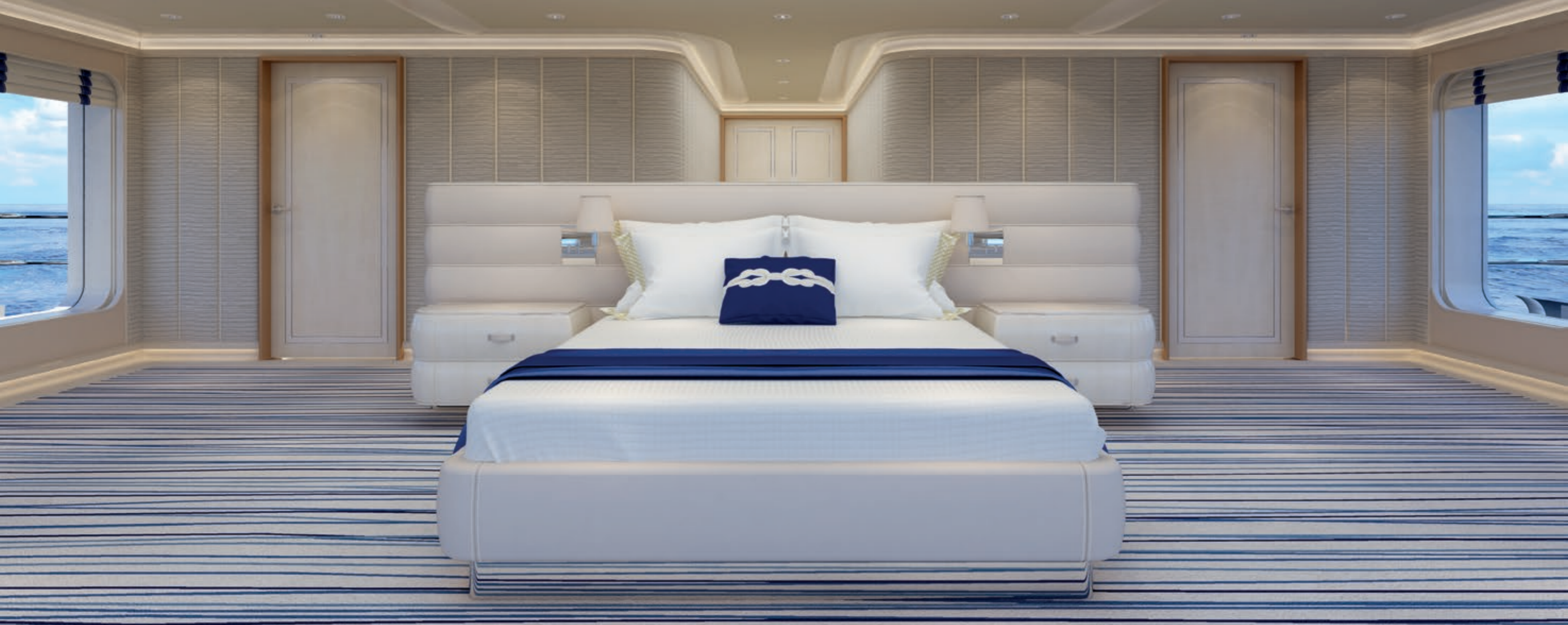
The owner's penthouse deck offers the ultimate in privacy and luxury. Magnificent views are afforded through large expanses of floor-to-ceiling windows. The spacious stateroom features his and hers bathrooms and dressing rooms.