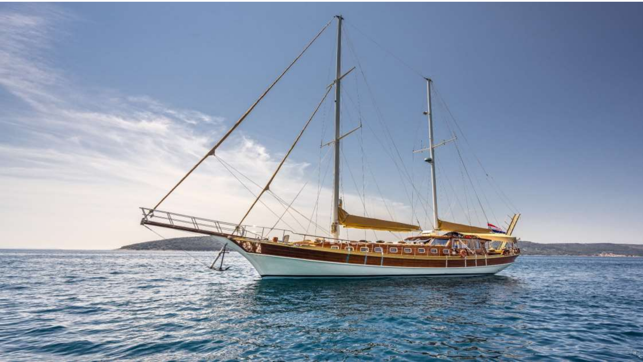
Gulet Angelica, 30 m, sleeps 10 guests