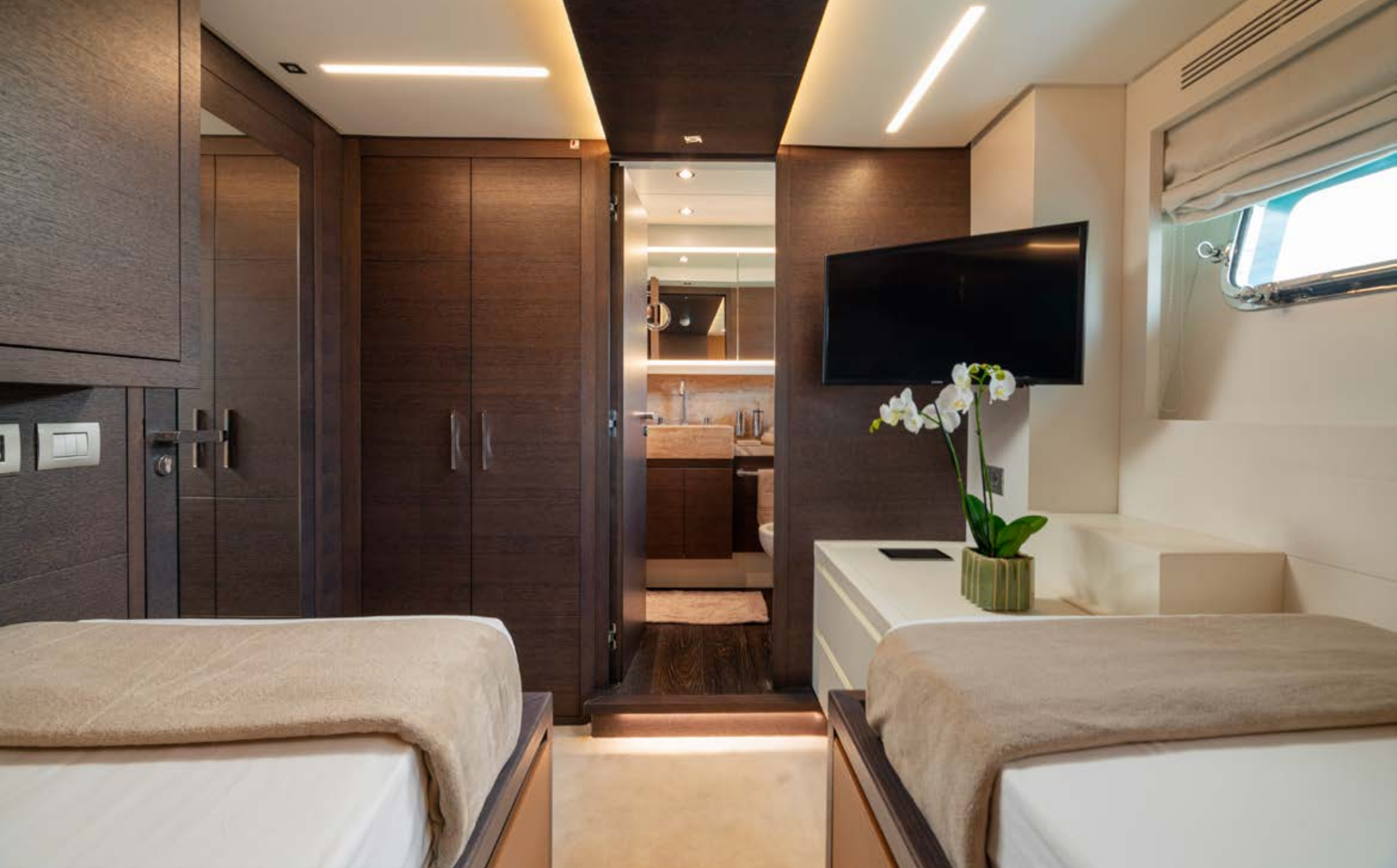
55 FIFTYFIVE | CERRI 102 FLYINGSPORT