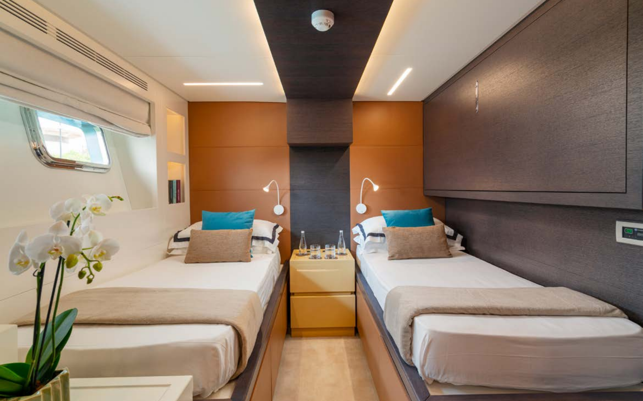
55 FIFTYFIVE | CERRI 102 FLYINGSPORT